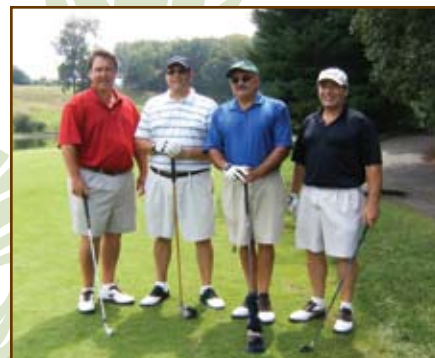
Hill Health Corp. Team