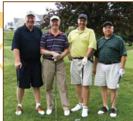
Shipman and Goodwin Team