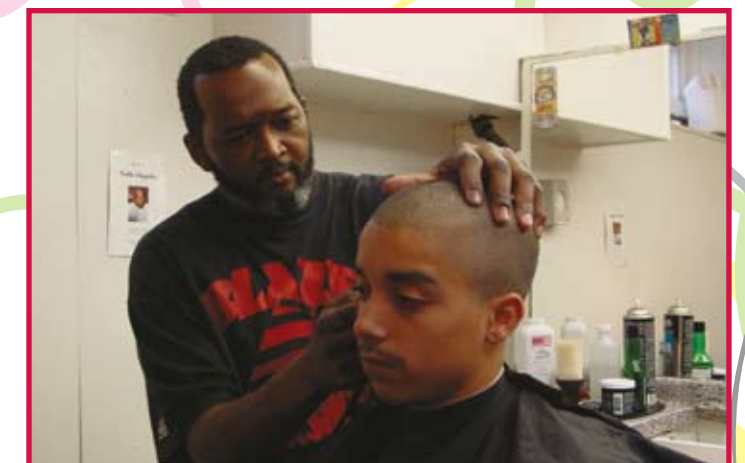
Blaze Barbershop, Hartford, CT