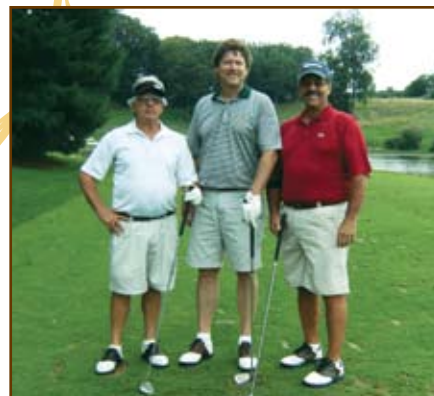
Metro Taxi Team