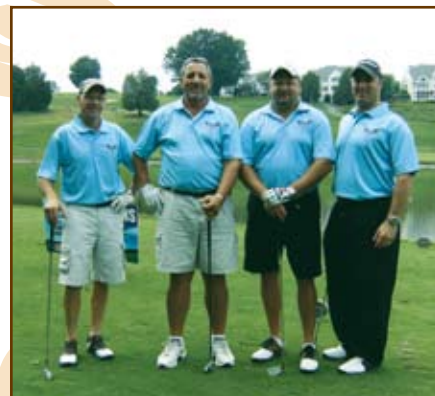
Eagle Sprinkler Fire Protection Team