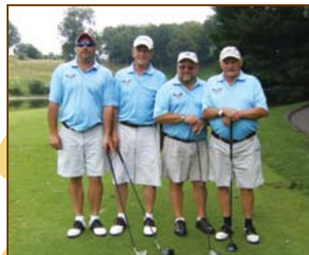
Freedom Fire Protection Team