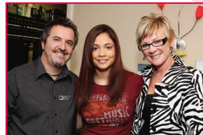
Gallery Salon, Farmington, CT