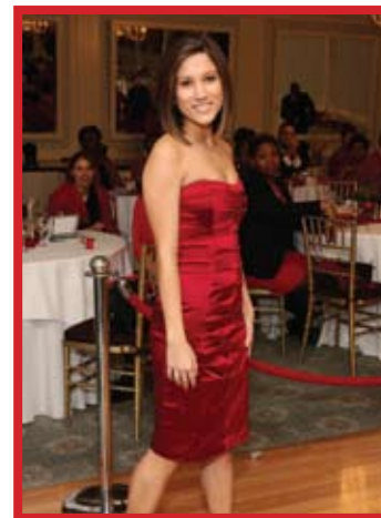
Red dress fashion show